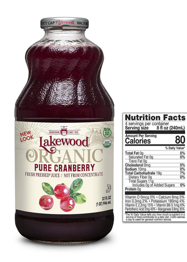
LAKEWOOD CRANBERRY JUICE