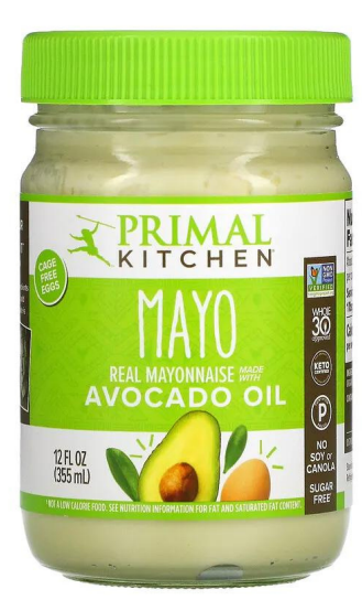
PRIMAL DRESSING MAYONNAISE