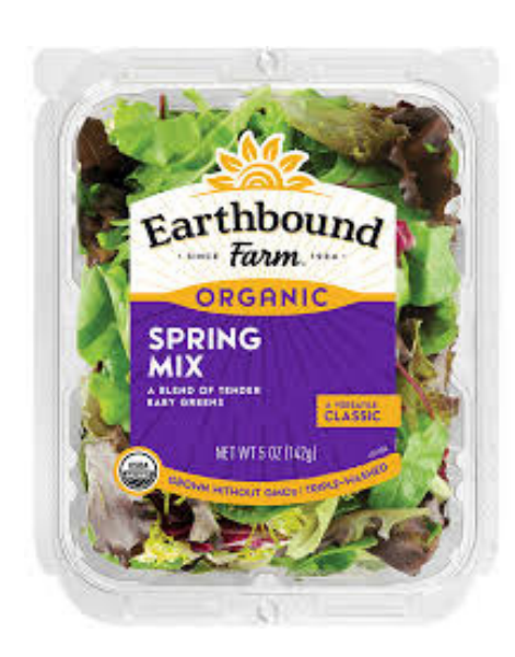
SALAD SPRING MIX