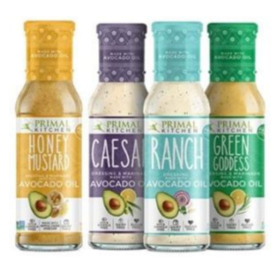
PRIMAL KITCHEN DRESSINGS