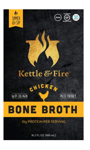
KETTLE & FIRE BONE BROTH