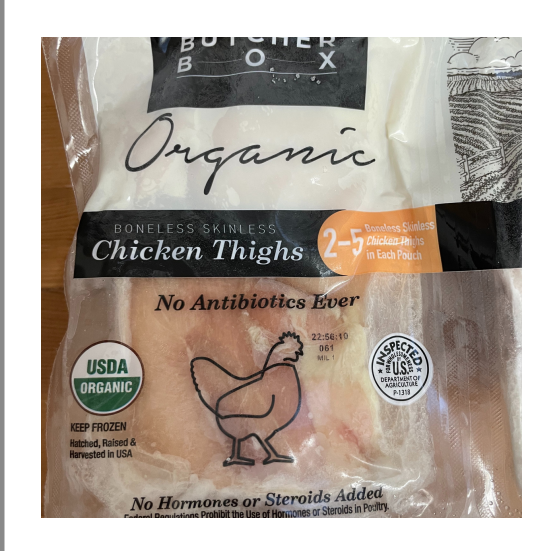
BUTCHER BOX CHICKEN