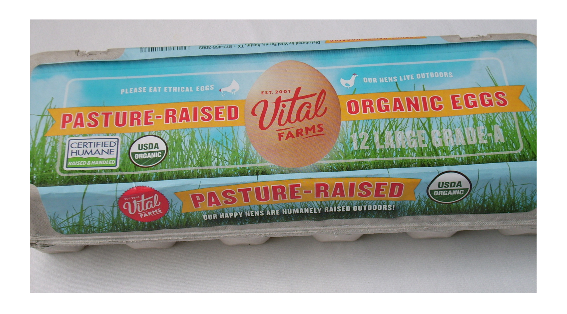
PASTURE - RAISED ORGANIC EGGS