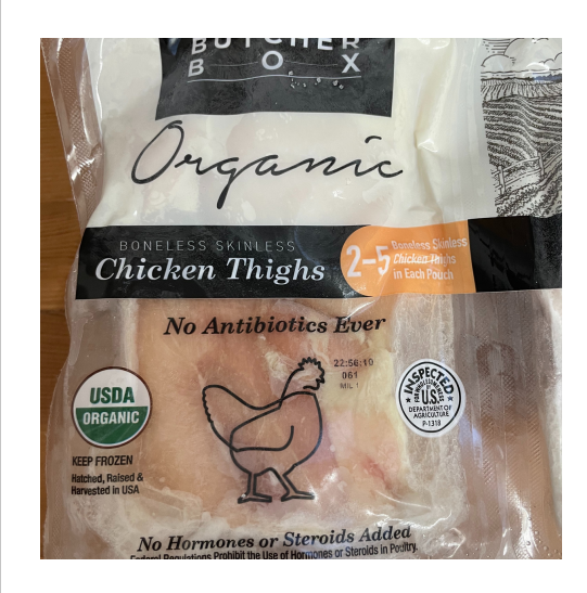
BUTCHER BOX CHICKEN