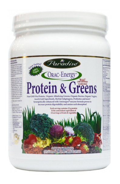
PROTEIN AND GREENS