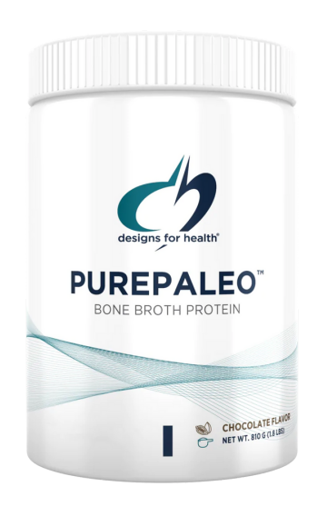
CHOCOLATE BONE BROTH POWDER